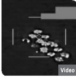
Airstrike on ISIL Targets in Syria | Video