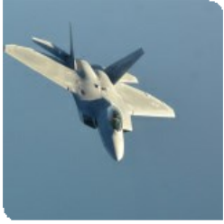
F-22 Raptors Conduct Debut Strikes On Syria