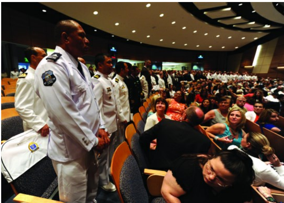
Guests watch as the U.S. Naval War College's 2013 graduating class enters Spruance Auditorium during a graduation ceremony, Newport, R.I., June 21, 2013. The graduating class of 2013 included 310 members of the U.S. Navy, U.S. Marine Corps, U.S. Air Force, U.S. Army, U.S. Coast Guard, National Guard, civilian government employees and 130 international naval officers.

IMET is a Department of State (DoS) program, funded by State, jointly managed by DSCA , and executed through the military departments. Essentially, it's a scholarship program for foreign personnel, promoting regional stability and defense capabilities. It funds military education and training courses within the United States for international military students (IMS) and related civilian personnel of foreign countries. It also provides limited education and training opportunities in foreign locales. The training and education opportunities eligible for IMET funding cover a broad array of topics, ranging from the proper operation and servicing of defense articles, combating terrorism, multilateral operations, and narcotics control to the proper role of a military in a democracy.