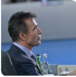
NATO Secretary General Anders Fogh Rasmussen Stepping Down