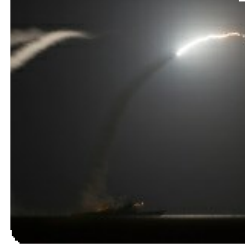
Strikes Begin Against ISIL in Syria