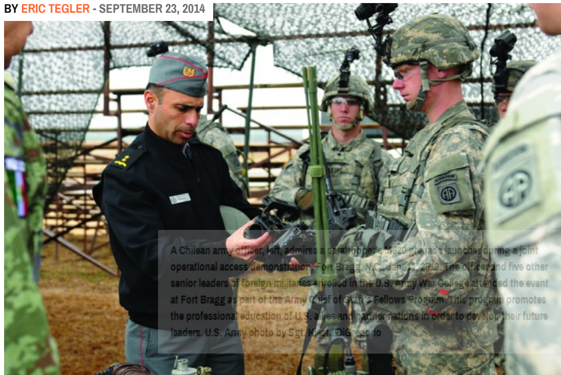
A Chilean army officer, left, admires a combat operator's M20 grenade launcher during a joint operational access demonstration at Fort Bragg, N.C., Jan. 21, 2013. The officer and five other senior leaders of foreign militaries enrolled in the U.S. Army War College attended the event at Fort Bragg as part of the Army Chief of Staff's Fellows Program. This program promotes the professional education of U.S. allies and partner nations in order to develop their future leaders.