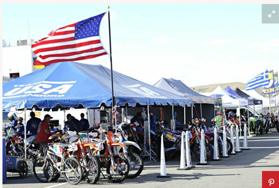
U.S. camp at ISDE 2016