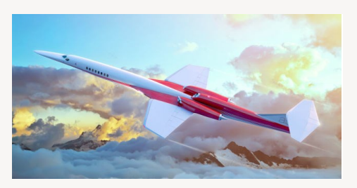
The Race Is On to Build a Supersonic Airliner by the 2020s