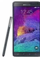
Samsung Galaxy Note 4 N910V - 32GB - Verizon + ...