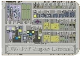
F-18F Super Hornet for HSG (Painted) 1/72 Eduard