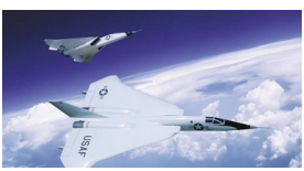
The North American XF-108 Rapier