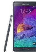
Samsung Galaxy Note 4 N910A 32GB Unlock...