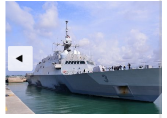
USS Fort Worth (LCS 3) Departs Singapore | Video