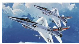
V-1600: The Carrier-Capable F-16 That Wasn't