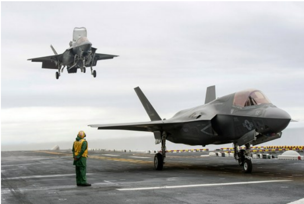
Two F-35B Lightning II aircraft land on the flight deck aboard the amphibious assault ship USS America (LHA 6). America, with Marine Operational Test and Evaluation Squadron 1 (VMX-1), Marine Fighter Attack Squadron 211 (VMFA-211) and Air Test and Evaluation Squadron 23 (VX-23) embarked, was underway conducting operational testing and the third phase of developmental testing for the F-35B, evaluating the full spectrum of joint strike fighter measures of suitability and effectiveness in an at-sea environment.

However, the program has run into a variety of technical, weight, and cost difficulties partly arising from its concurrent development strategy.