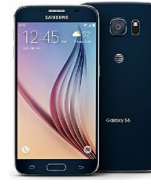
Samsung Galaxy S6 SM-G920a Unlocked Smartp...