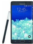
Samsung Galaxy Note Edge N915v 32GB Verizon an...