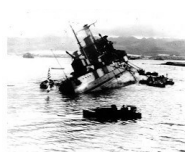
Utah Was the "Not So Famous" Battleship...