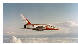
North American's F-107 Was the "Ultra Sabre" ...