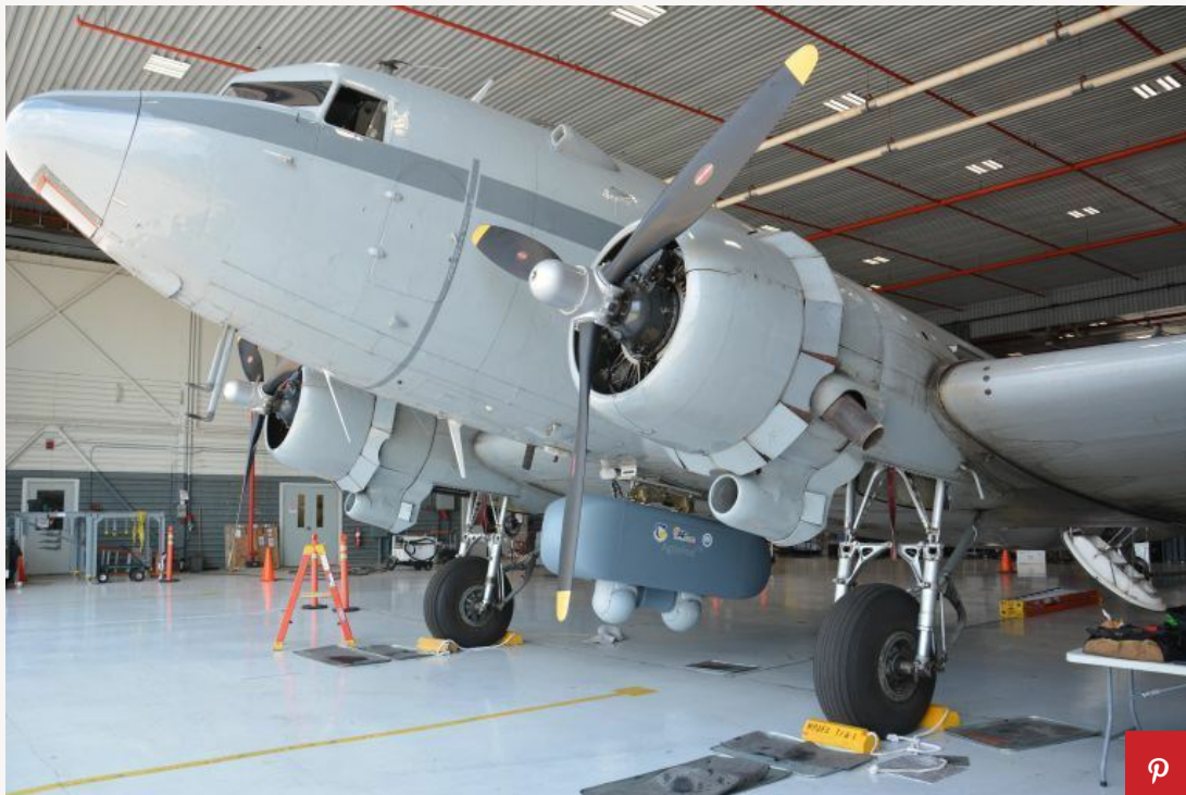
A Douglas DC-3 provides the testing bed for the next-generation sensor array for MQ-9 Reaper drones.

The DC-3 remained on military duty until 2008—72 years—until the Air Force's 6th Special Operations Squadron finally retired its turbine-powered Gooney. Other DC-3s continue to fly missions as sensor development testbeds for the military and as freighters with companies like Canada's Buffalo Airways.