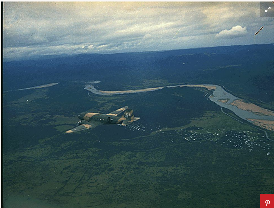
U.S. C-47 engages in psychological warfare by dropping leaflets in South Vietnam, 1969.

That included going back to war. In response to increased attacks by Viet Cong on rural South Vietnamese outposts in Vietnam in 1963, American Air Commandos began assisting the defense of small villages at night by using their C-47 transport aircraft to fly in circles and drop illumination flares, exposing attackers to the defending troops. The practice inspired the idea of fitting the C-47s with firepower and ultimately an Air Force effort called Project Gunship I.