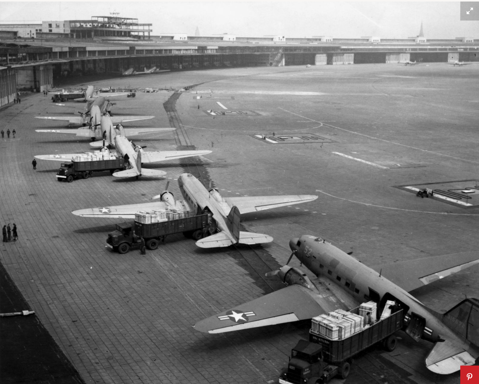
U.S. C-47 Skytrains unloading supplies at Tempelhof airfield during the Berlin Airlift in 1948-49.